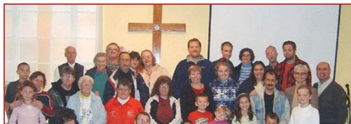
A warm community at Welcome Inn.