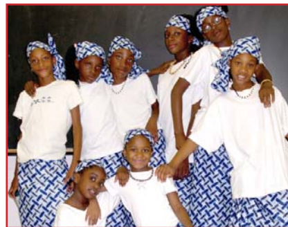
Dancers at a Warden Woods celebration.

MCEC celebrated the Christian presence that two congregations have provided to their communities for many years as they both held their final worship services. Warden Woods Mennonite Church (Toronto) and Welcome Inn Church (Hamilton) officially closed their doors after much discernment and prayer. May God be praised for the lives impacted and changed by the faithful ministry of the members of these congregations. We thank God for leaders, past and present, who served these congregations.