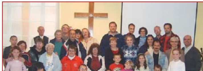
A warm community at Welcome Inn.