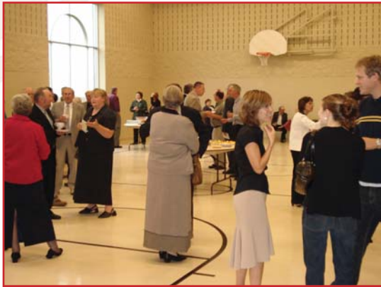
How Might Our Building Glorify God?

MCEC staff resource and walk with congregations as together we extend the peace of Christ in our communities.