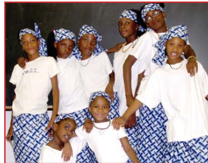
Dancers at a Warden Woods celebration.

MCEC celebrated the Christian presence that two congregations have provided to their communities for many years as they both held their final worship services. Warden Woods Mennonite Church (Toronto) and Welcome Inn Church (Hamilton) officially closed their doors after much discernment and prayer. May God be praised for the lives impacted and changed by the faithful ministry of the members of these congregations. We thank God for leaders, past and present, who served these congregations.